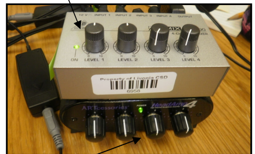
volume control / amp

3. Plug the long cable from the back of the mixer (from the two-plug adaptor in the “output” plug) to the microphone input on the front of your computer. The very short cable connects the “output” plug on the back of the mixer (top box) to the “Stereo in” plug on the back of the volume control (bottom box.)